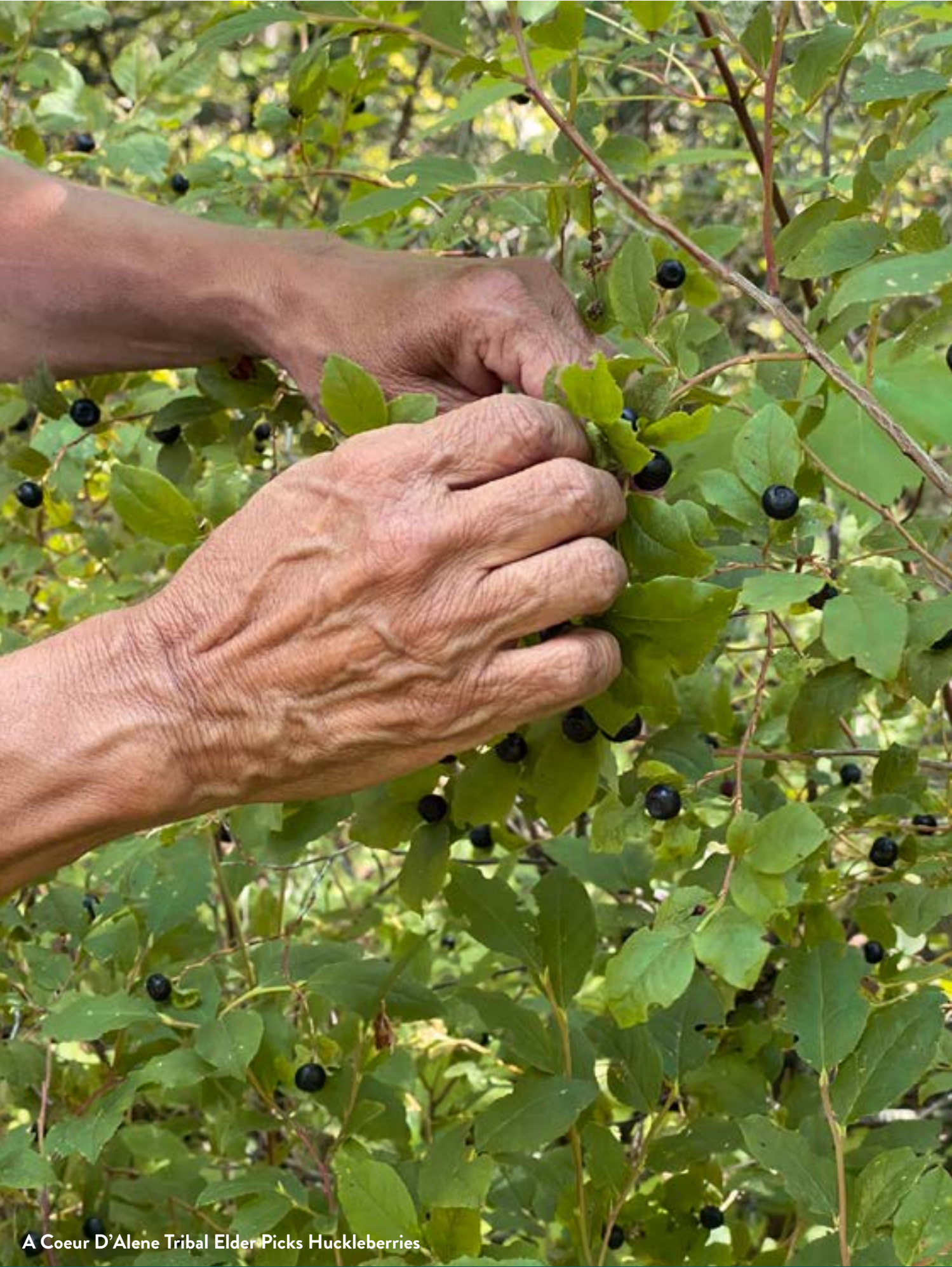
A Coeur D'Alene Tribal Elder Picks Huckleberries